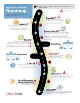
Secondary Transition Roadmap

The Ohio Department of Education (ODE) has a new, interactive resource to prepare families with children with disabilities, ages 3-21 for their 'Road Trip'. <u>Check it out</u>!